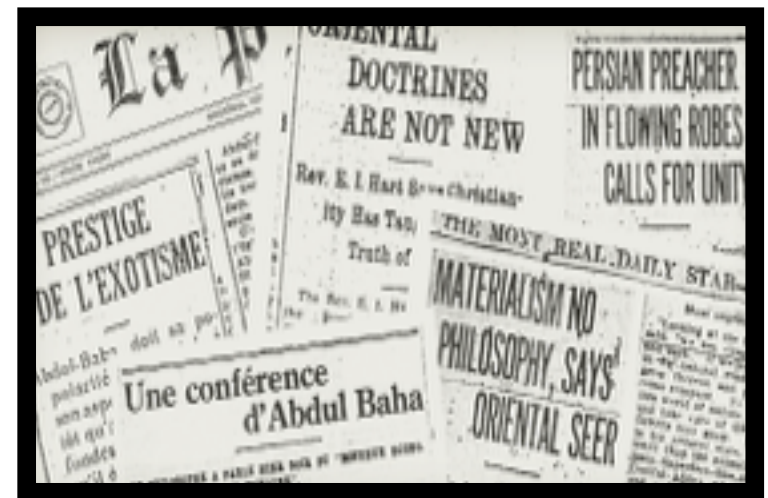
Press coverage for 'Abdu'l-Baha in Montreal newspapers Sept 1912

Please join us for a celebratory, informative and stimulating afternoon on August 30!